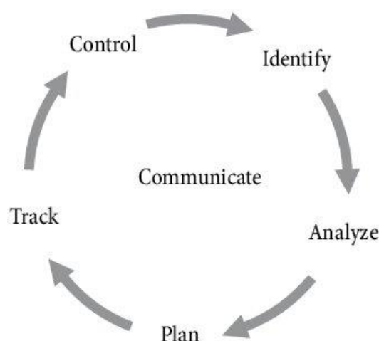
Figure 2. Continuous Risk Management paradigm

AERO's risk management plan has been produced based on the Continuous Risk Management (CRM) paradigm developed by the Software Engineering Institute (SEI) as indicated in Figure 2.